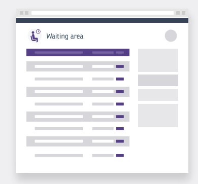
Clinician joins patient's video room and the consultation begins

Clinician notes next appointment via video and enters online waiting area