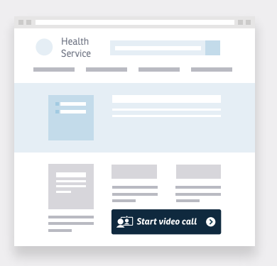
Patient does not require a login account, room ID, or password

Patient opens health service website in browser, clicks Start video call button